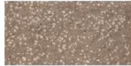
La Paz w/ Pumice